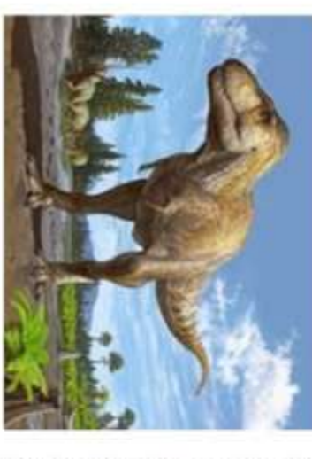
Pictured: An image of Tyrannosaurus mcraeersis released by the New Mexico Museum of Natural History @NMMNHS_Paleo X page and Science, Source: NMMNHS Paleontology

after examining parts of the animal's discovered in New Mexico, USA. 4m high and weighing around 8.8 tonnes their relative the T. rex – 12m long, up to ago, would have been similar in size to that lived between 71 and 73 million years its closestrelative! The huge theropods approximately five million years before the massive carnivore, thought to have lived Paleontology Curator at NMMNHS. The drawers!' said Dr. Spencer Lucas, the state, both in the rocks and in museum new dinosaurs remain to be discovered in dinosaur fossils becomes clear – many scientific importance of New Mexico's Museum of Natural History & Science currently on display at the New Mexico Hall Lake Formation, a geological Palaeontologists made the announcement Tyrannosaurus rex (T. rex), is thought to be fossilised skull that had been found at the NMMNHS). 'Once again, the extent and ormation in Sierra County. The skull is